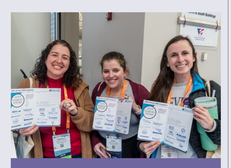
Passport to Care participants with their completed passports at the Foundation's booth.

Donors contributed more than $67,000, while the annual Passport to Care activity further bolstered our efforts, with participation from 16 companies raising over $142,000 to support oncology nurses. Sponsorships raised more than $68,000, with support from the Dana-Farber Cancer Institute, Genentech, Gilead, Memorial Sloan Kettering Cancer Center, and Sylvester Comprehensive Cancer Center.